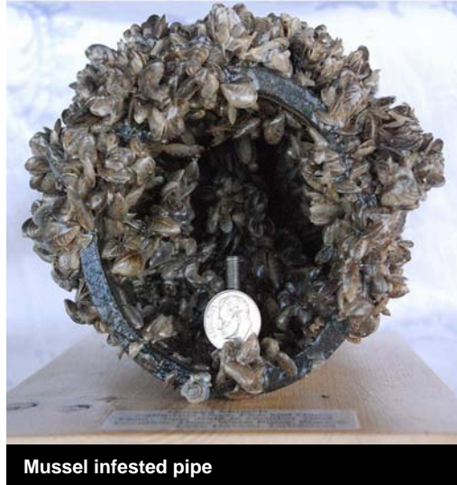
Mussel infested pipe

Invasive species are non-native plant or animal species, introduced intentionally or unintentionally from other countries or areas. Aquatic invasive species establish in water bodies and are of particular concern to irrigation districts and irrigation farmers. Prussian Carp, Flowering Rush, Eurasian Water Milfoil and Zebra and Quagga Mussels are some of the species that are currently of concern to Southern Alberta's Irrigation Districts. Movement of aquatic invasive species into new areas mainly occurs by travelling watercraft. Zebra Mussels are continuing to spread closer to Southern Alberta and are now established in Lake Winnipeg in Manitoba as well as water bodies in Arizona, Nevada and California; areas that many Albertans frequent with their watercraft. Once established, mussels will clog water delivery infrastructure change the ecological make up of irrigation reservoirs. The economic, ecological and social costs are significant.